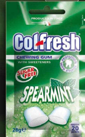
Pack "Zipper Pouch"