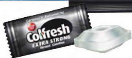
Standard pack - Bag 70 gr