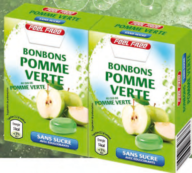
Pack 2 flip top boxes "side by side" (Standard pack - 2x50gr)