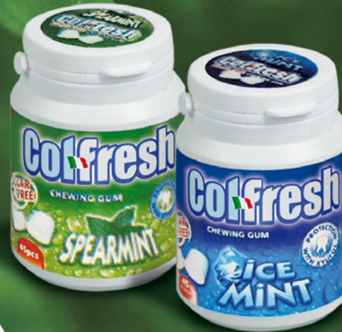
Pack "Plastic Jar"

Also possible multipacks of 5 and 6 sticks