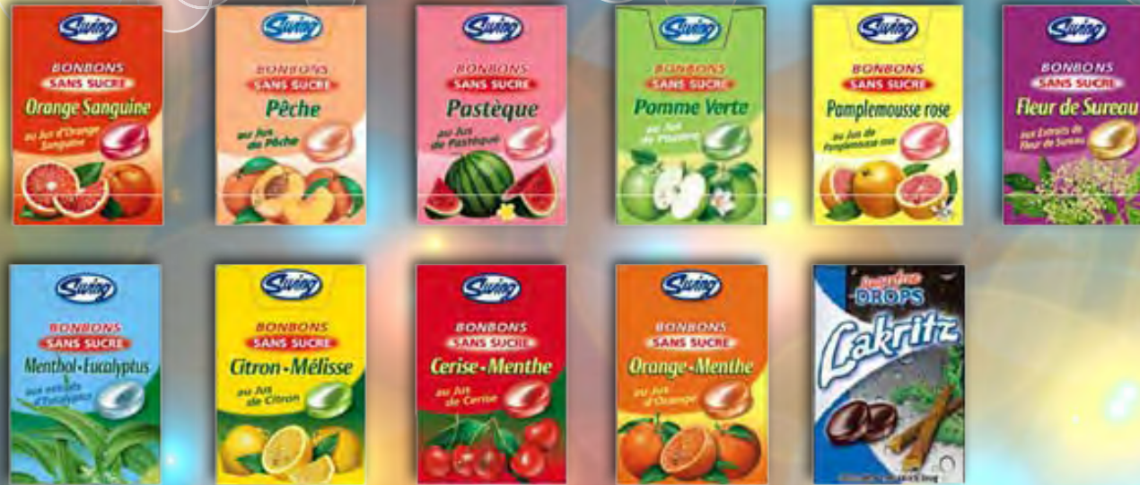
Flip top boxes, bipack 2x50gr