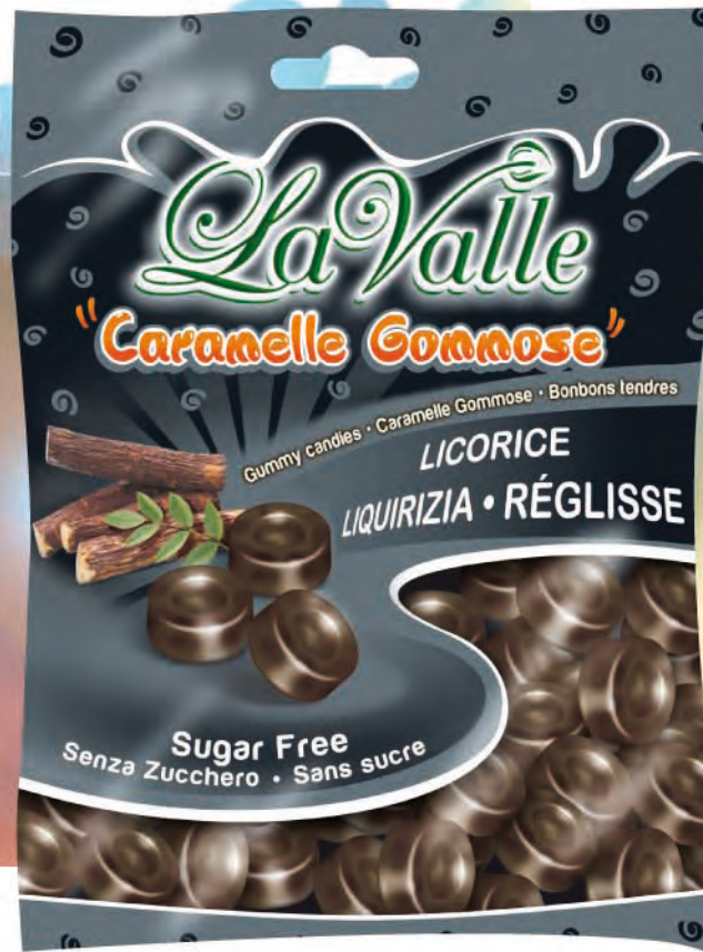
Gummy Candies (Standard pack - bag 79 gr)