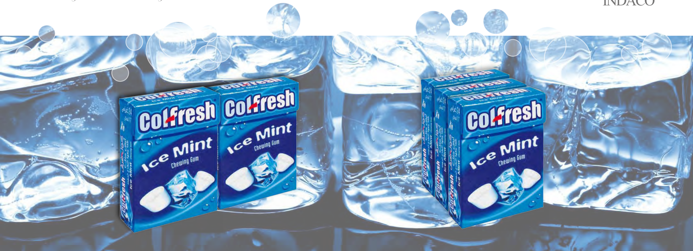
Pack of 2 flip top boxes "side by side" (Bi-pack standard - 2x25gr.)