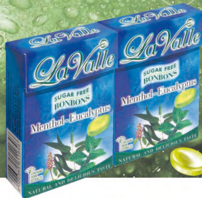
Pack 2 flip top boxes "side by side" (Standard pack - 2x30gr)