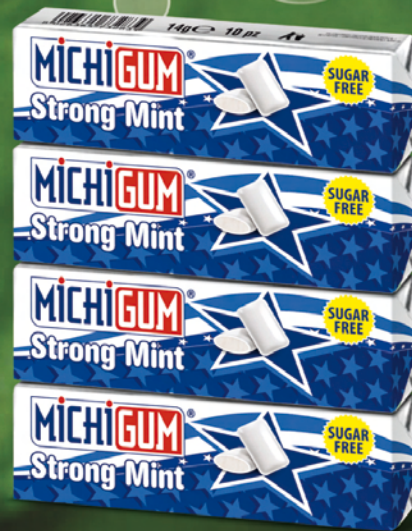
Pack "Multipack Stick"